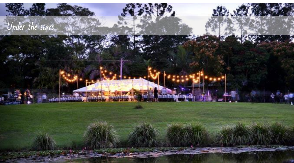
Under the stars